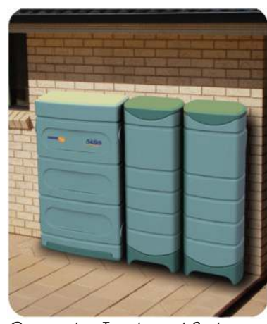
Greywater Treatment System

it cannot be used in above ground irrigation systems (microsprays, pop-up or shrub sprays), or in the house (including toilet flushing). We recommend that only light greywater be diverted to the garden.